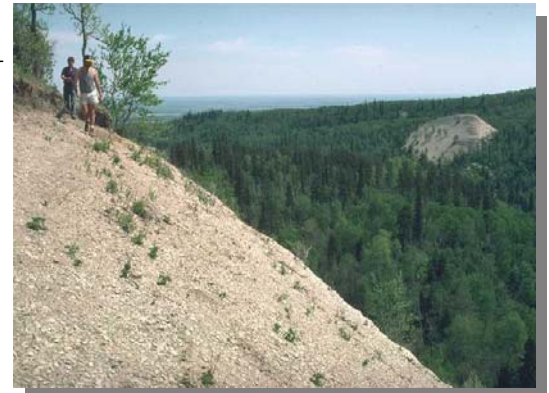
The Parkland Region has spectacular natural beauty; a great place to live and work!

Most municipal parks are recreation oriented, with playgrounds, swimming pools and arenas. Parkland boasts the only indoor wave pool in the province. Larger communities offer camping facilities with varying services available. Seven well-groomed golf courses are situated throughout the Region. Public parks and natural areas help maintain our health and well being. Green spaces provide opportunities for people to engage in recreational and contemplative activities.